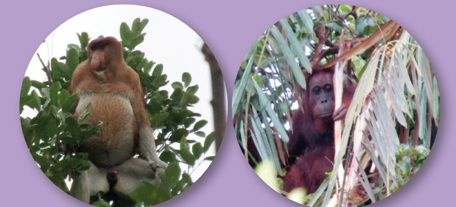
Picture of Proboscis Monkey and Orangutan in our area at PT BSS