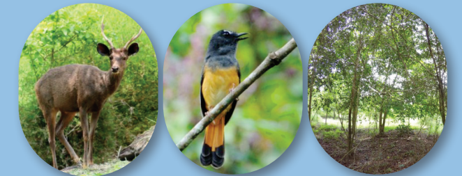
Picture of a Sambar deer (Left) and Rufous-tailed Shama (Right) found within the project site.