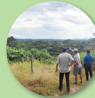
IOI Plantation and Nestle Project RELeaf team conducted two field surveys in November 2021 and June 2022, respectively