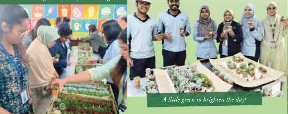
A little green to brighten the day!