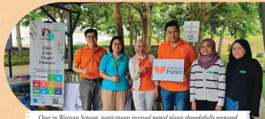
Over in Warisan Sepang, participants received potted plants thoughtfully prepared by our in-house landscape team, inspiring simple gardening habits at home.

Residents conveniently dropped off their recyclables at our sales offices in 16 Sierra (22 February), Bandar Puteri Puchong (8 March), Warisan Sepang (10 May), IOI Resort City (10 May), Bandar Puteri Bangi (24 May) and Bandar Puteri Klang (14 June). The more they recycled and the heavier their items, the more cash vouchers they received to redeem sustainable merchandise from Zero Waste Earth Store, along with some extra eco-friendly rewards too.