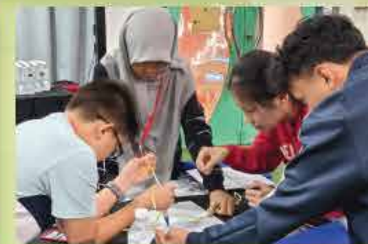
Figuring out, one challenge at a time.

Growth begins where we least expect it, and 28 youths learnt some of life's best lessons outside the classroom, surrounded by nature and guided by the right people. The 20-acre nature adventure park of Semenyih EcoVenture Resort & Recreation was the perfect setting for self-discovery, connection and leadership growth.