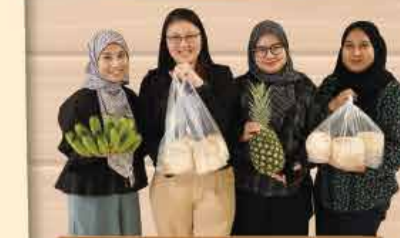
Pineapples, coconuts, bananas – what a fruitful harvest from our intercropping efforts at Sagil Estate.