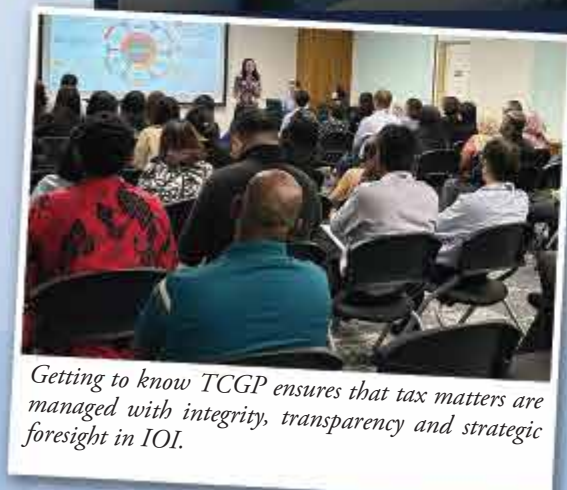
Getting to know TCGP ensures that tax matters are managed with integrity, transparency and strategic foresight in IOI.

This milestone marks our commitment to transparency, accountability and risk management, aligning closely with the Inland Revenue Board of Malaysia's co-operative compliance initiative, and setting a new standard in how we manage tax across the Group. It sets the stage for stronger tax governance at IOI as Group Tax works closely with business units to enhance tax awareness, implement strong internal controls, and foster open communication with tax authorities.