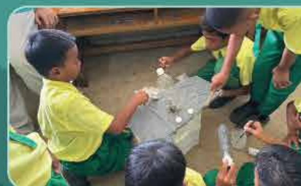
Elephants made from cardboard to spark creativity and teamwork.

Children, do you know that there are only fewer than 1,500 elephants still roaming in the wild?