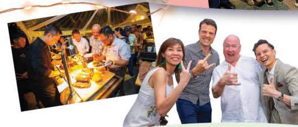
Sharing smiles, laughter and the spirit of giving throughout the charity event.