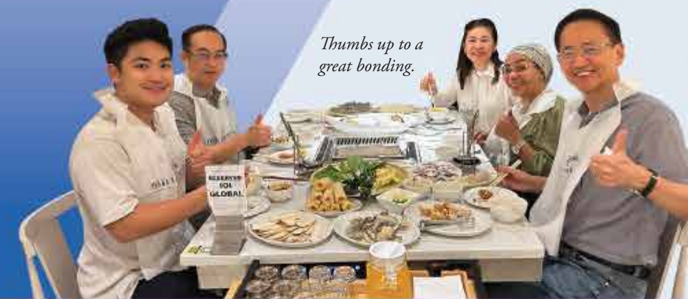
Thumbs up to a great bonding.

Leadership is a daily practice. It's about how you show up, how you build trust among others, and how you lead with purpose towards a shared vision to drive IOI into a resilient future.