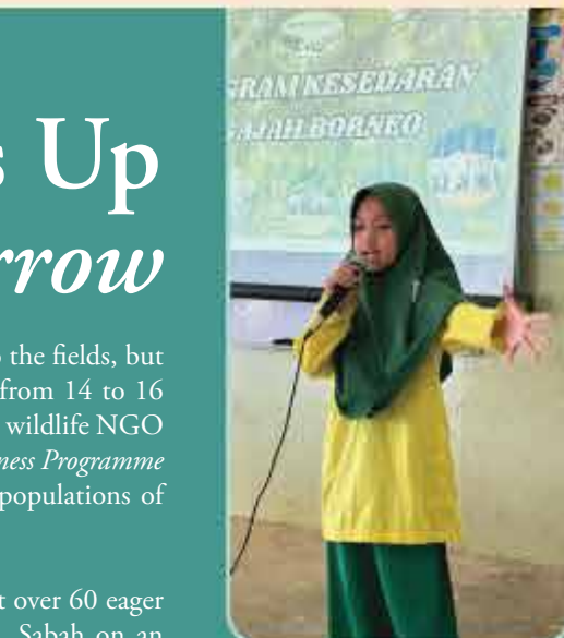
This young storyteller's message rings clear – we need to protect our elephants!