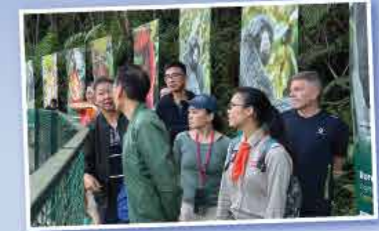
Let's connect with nature and grow a mindset for positive impact.