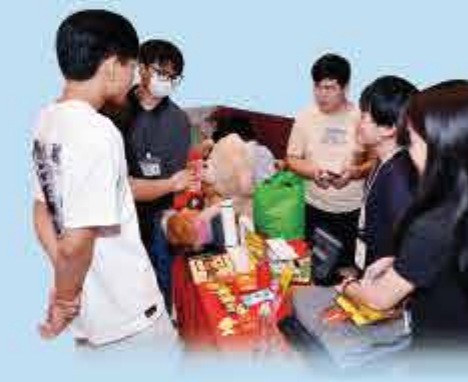
Students in action, giving pre-loved items a second chance.

Through the Bargain Basement platform, students can gain practical experience in business planning, creative problem-solving and community engagement. Here, 77 students, divided into 14 groups, will run the project hands-on – from collecting and sorting donated pre-loved items to pricing and selling them, to splitting the proceeds evenly between charity and student learning activities. With guidance from lecturers, they can develop teamwork, entrepreneurial thinking and social responsibility.