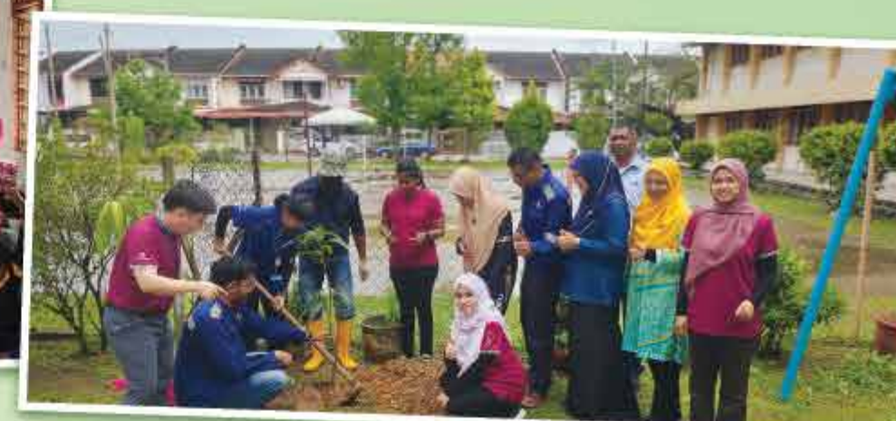
To save Mother Nature, let's plant more trees!