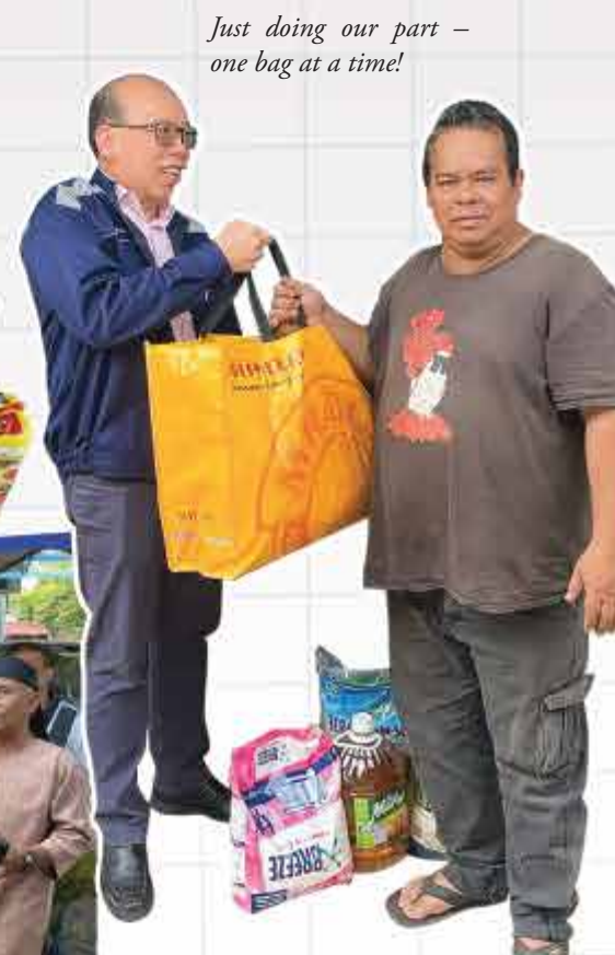
Just doing our part – one bag at a time!