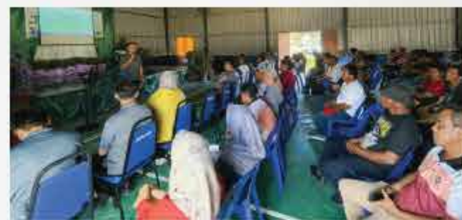
An employee at the Morisem Club House getting clarifications on the lockout/tagout procedures when working on electrical equipment.

"Electrical safety begins with responsibility. Every action we take - whether on-site or in support - matters in protecting lives," Energy Commission of Sabah.