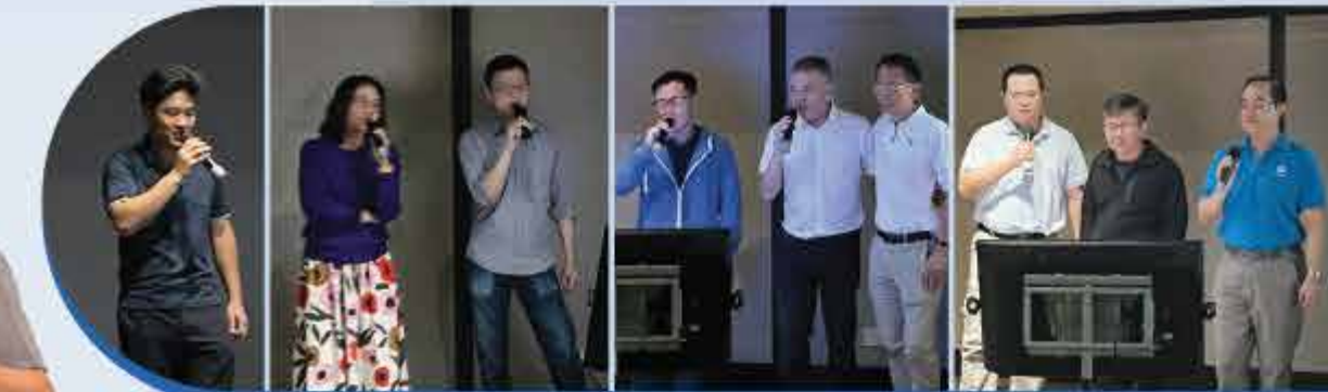
From flipcharts to falsettos – let's turn up the volume on fun and hit the notes!