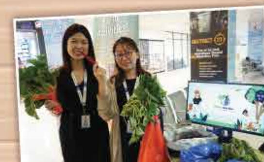
Healthy greens from our Urban Garden nourish both employees and animals at IOI City Farm in a tasty win for zero waste.