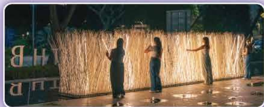
Saulux by SPLACES.STUDIO in Malta

The i Light Singapore 2025 lighted up the Lion City once again with 17 imaginative art installations that spread out across various locations, including South Beach, from 29 May to 21 June 2025. First held in 2010, this festival encourages sustainable habits through the showcase of energy-saving lightings and environmentally-friendly materials by Singaporean and international artists. Themed To Gather , check out the following two illuminating creations at South Beach.