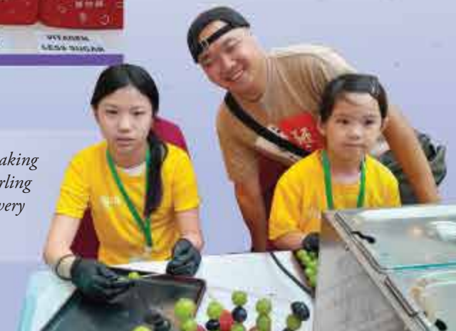
Trying their hands at making Tanghulu – dipping, swirling and having fun with every glossy fruit stick.

Getting a hands-on taste of what it means to earn through simple, honest work.