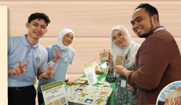
Tetra Pak Malaysia encouraging us to practise recycling and showing how easily we can give beverage cartons a new life.

Our Urban Garden, established in 2023, also brought along some lovingly harvested edible greens that were all up for grabs! Today, our gardening plots are buzzing with butterflies and bees, and a bounty of fruits and vegetables like water spinach, corns, eggplants, kohlrabis, passion fruits, pumpkins and more. We rely on organic pesticides and promote natural pest control through beneficial allies like weaver ants, lady beetles, crab spiders, assassin bugs, wasps and the ever-watchful praying mantis. So if you spot them among the leaves, don't chase them away because they are the guardians of our harvest.