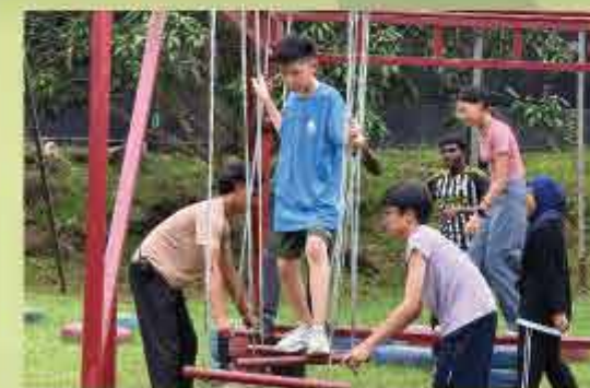
Teamwork means helping one another.