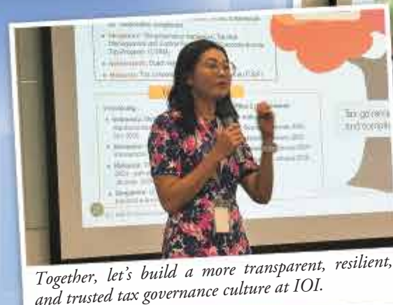
Together, let's build a more transparent, resilient, and trusted tax governance culture at IOI.