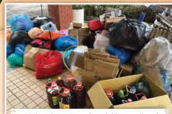
Look at the amount of recyclables we collected in Bandar Puteri Klang!