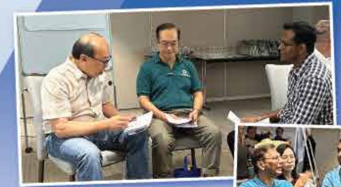
Conversations and ideas that carry us forward.