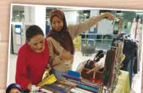
Hey, there are plenty of feel-good bargains at Bargain Basement!