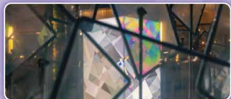
This is Not a Screen by National University of Singapore students

When you run your fingers through this dense field of willow-like twigs, each stem will alight in a golden and gentle glow at 2200K. The name captures the essence of the artwork: saule (willow) meets lux (light), revealing the invisible currents that flow through our everyday environment, and encouraging you to engage with nature in a playful, sensory way. Just like nature, no two moments are ever the same.