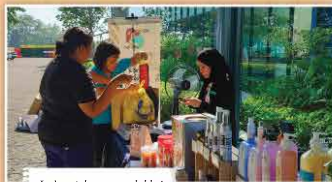
Let's weigh our recyclables!