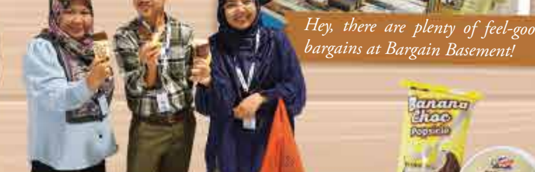
And hey, let's not forget the yummy ice cream, banana cakes and pineapple tarts – every bite was a feel-good win for the planet.