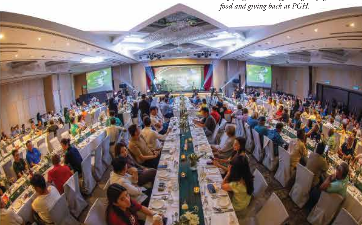
Enjoying a meaningful night of good food and giving back at PGH.

21 June 2025 teed off with 128 golfers at the 18-hole Palm Garden Golf Club followed by a sizzling BBQ cook-off dinner at Palm Garden Hotel (PGH). With more than 200 guests, the event raised an impressive RM100,000 in support of local community projects and UNICEF (United Nations Children's Fund). It reflected how collective efforts can make a real difference – bringing people together, creating connections and giving back to those who need it most – one step, one swing, one act of kindness at a time.