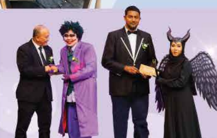
Our two favourite villains, Maleficent and The Joker won Best Dressed.