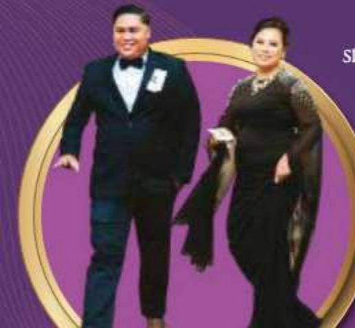
Meet the Best Dressed winners who dressed to impress and won in style!

The Best Dressed competition saw some truly stunning looks, and the anticipation reached its peak during the grand lucky draw, where 80 prizes – including vacuum cleaners, rice cookers, toasters, hairdryers and many more – found lucky winners. What a night of elegance, entertainment and great company – Ladang Sabah Recreational Committee sure knows how to start the year in style!