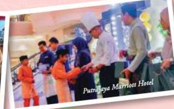
Putrajaya Marriott Hotel