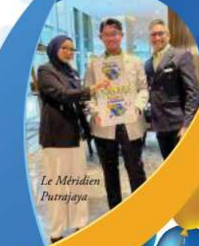
Le Méridien Putrajaya