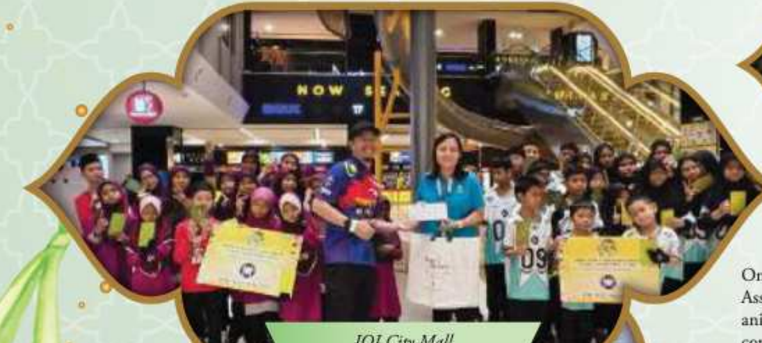
IOI City Mall

IOI Mall Damansara lit up on 12 March 2025 as we treated children from Pusat Jagaan Rumah Juara and Rumah Jagaan Kasih Murni to an unforgettable adventure with Malaysia's favourite animated secret agent, Ejen Ali , at the Centre Court. It was our first-ever Raya celebration campaign, and one to remember! After a welcoming buka puasa session, the celebration continued with singing competitions and a stunning performance of Hanya Kamu V2. The children's smiles said it all – this Raya was all about sharing, caring and spreading joy.