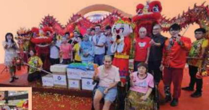
Wishing every one of you good health, joy and prosperity!