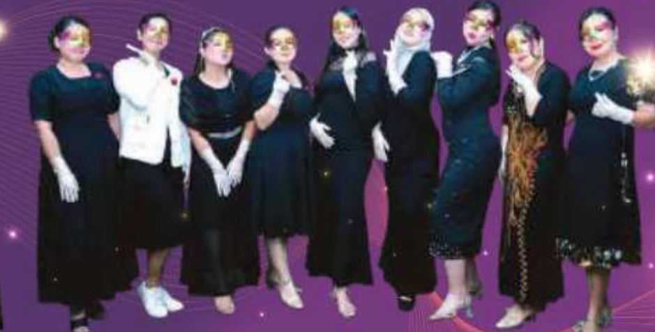
The ladies looking fabulous with their stunning outfits!