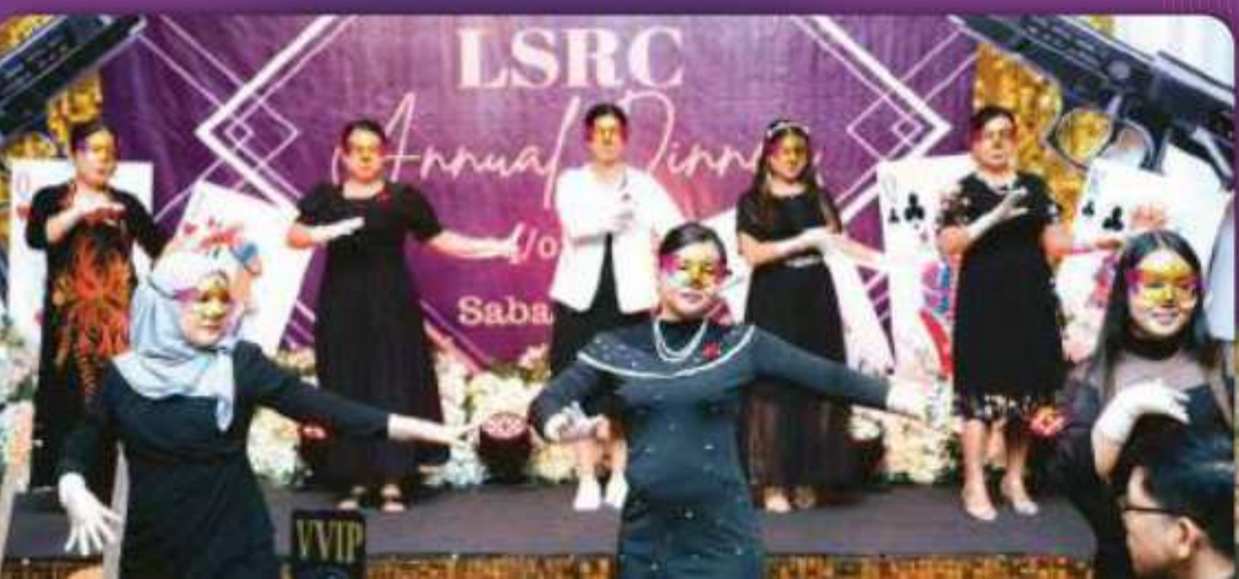
The stage lighting up, and the crowd loving every second of it!