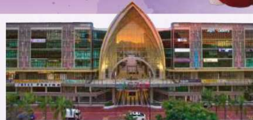
The five-storey strata shops and offices of Phase 2 promote al fresco retail opportunities, with surface parking and a centre courtyard ensuring convenience for all.

Don't wait. Grab your chance now. Check out: https://shorturl.at/DrRmQ