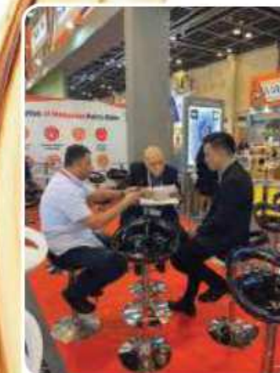
Our participation, under the Malaysian Palm Oil Council, was alongside 90 local companies and four government agencies from Malaysia.