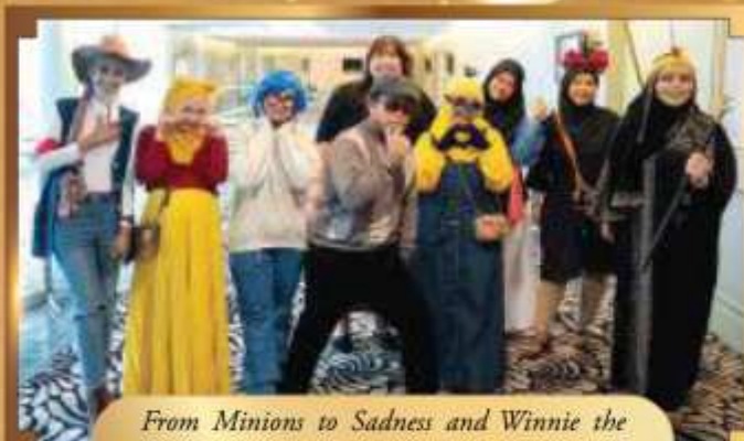
From Minions to Sadness and Winnie the Pooh , our team lit up in full movie star style!