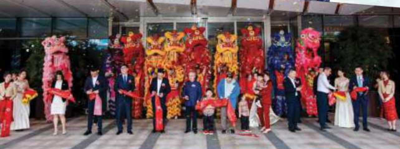
From a grand ribbon-cutting opening ceremony to a live band and musical performances to engaging arts and crafts activities, the launch was a whirlwind of excitement.

Check out Sheraton Grand Xiamen Jimei Hotel at: https://shorturl.at/fRqiE