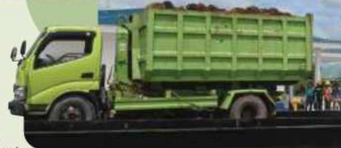
The first weighing of FFB to commemorate the new mill.