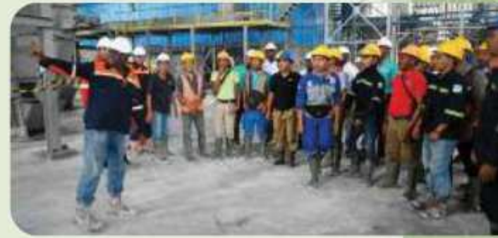
The workers receiving a site briefing of the facilities around the new mill.

We started the project on 8 August 2023 by clearing 20 hectares of land and incorporating tilting sterilisers to streamline processing and reduce manual handling. This project is a noteworthy investment in the production of sustainable palm oil.