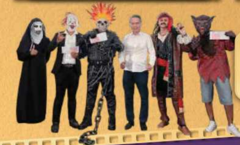
The Queen of Hearts stole our hearts and won Best Dressed Female while Ghost Rider spooked his way to Best Dressed Male.