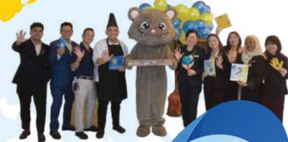
Four Points by Sheraton Puchong