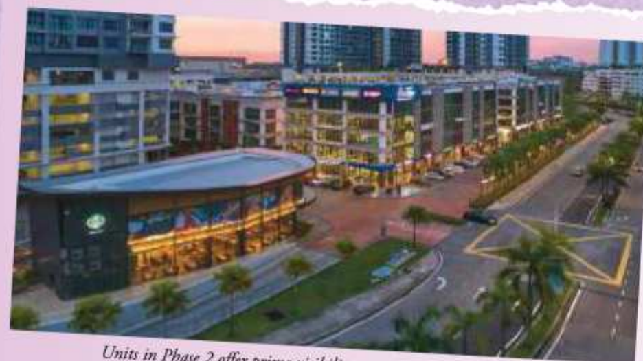
Units in Phase 2 offer prime visibility to surrounding roads such as Lebuhaya Putrajaya-Dengkil-KLIA and Persiaran IRC 3.