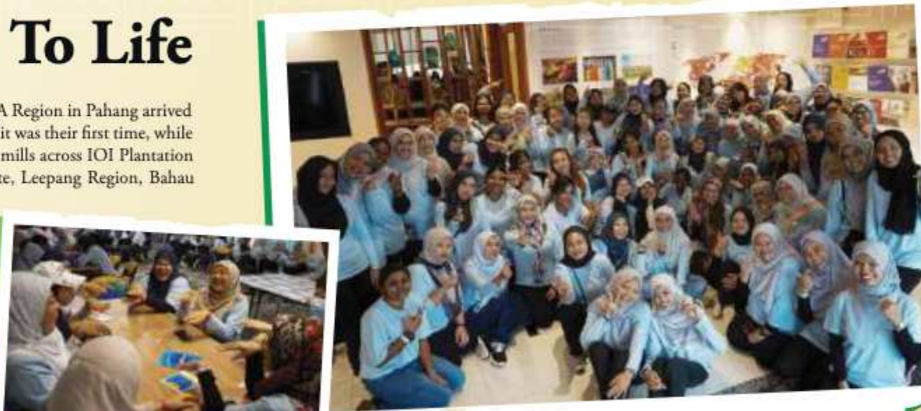
Let's rehearse our team cheer.

A big shout-out to Team Red for being the overall champion, with Team Green and Team Pink securing second and third place, respectively. But at the end of the day, everyone was an IOI champion, taking home cash prizes, great memories and a renewed sense of purpose.