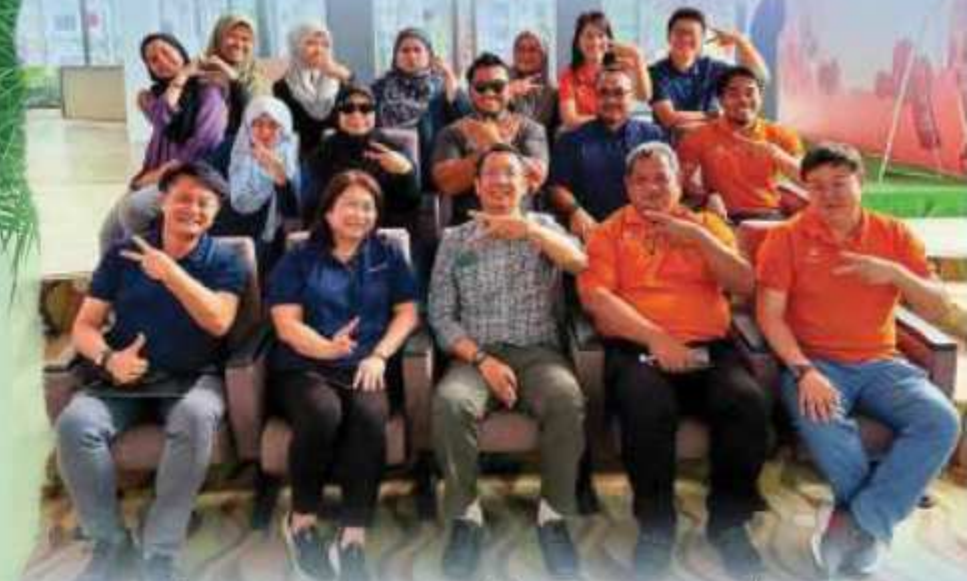
Everyone is now more empowered than ever to integrate biodiversity conservation into our operations!