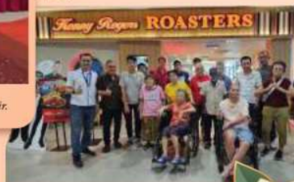
Nothing brings people together like a good meal!