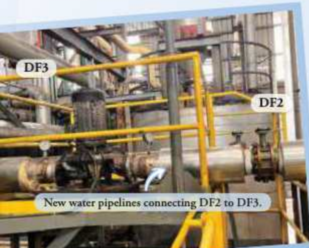
New water pipelines connecting DF2 to DF3.

We expect to gain considerable savings when the system stabilises. Nevertheless, by fully idling DF1, we anticipate monthly electricity savings of 2,391 kWh and steam savings of 25.97 tonnes, leading to an estimated greenhouse gas reduction of 3,185 kgCO 2 -eq per month. It's a move towards crystal-clear results!