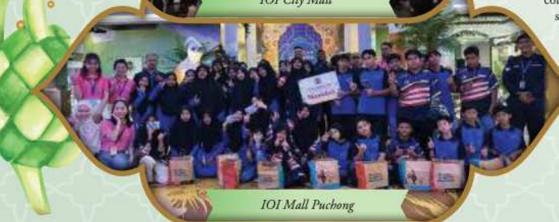
IOI Mall Puchong