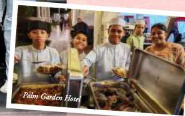
Palm Garden Hotel