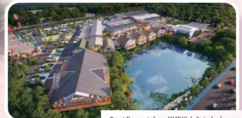
Bangi Fresco reinforces IOIPG's holistic development approach in Bandar Puteri Bangi.

Spanning 12.3 acres, Bangi Fresco is set to become the neighbourhood's ultimate landmark just next to IOI Galleria @ Bandar Puteri Bangi. With a sprawling 100,000 square feet (sq ft) of retail space, including 24 shops, five waterfront eateries, alfresco dining spaces and four drive-through outlets for added convenience, a 19,000 sq ft grocery operator to meet daily needs, as well as a 10,000-sq ft event hall and sports centre plus 350 parking bays, it is perfect for a large crowd to unwind, host social gatherings or embrace an active lifestyle.