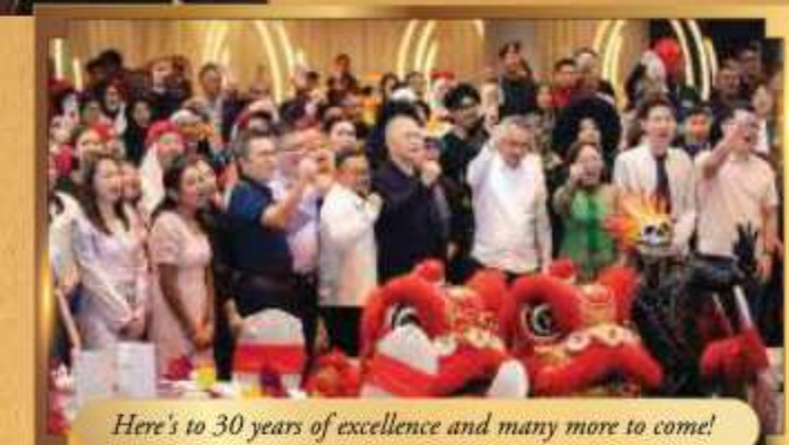
Here's to 30 years of excellence and many more to come!