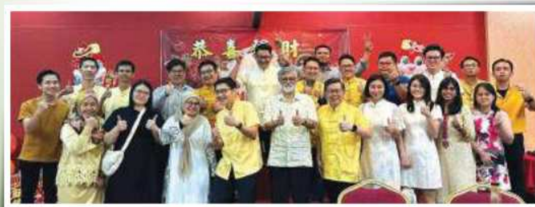
Looking forward to building more successful partnerships in the future!