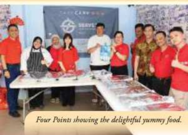
Four Points showing the delightful yummy food.