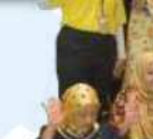
Palm Garden Hotel