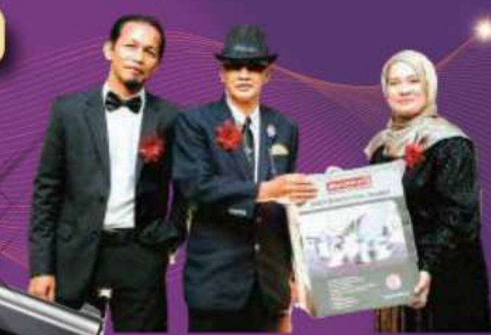
80 lucky winners walking away with fantastic prizes!