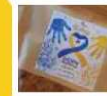
Putrajaya Marriott Hotel

Kudos to Putrajaya Marriott Hotel, Le Méridien Putrajaya, Courtyard by Marriott Penang, Palm Garden Hotel, Moxy Putrajaya, and Four Points by Sheraton Puchong for uniting in blue and yellow to champion Diversity, Equity and Inclusion, and standing up for the rights of individuals with Down syndrome who deserve to be seen, valued, and embraced for who they are! From setting up donation boxes and raising funds for a Down syndrome charity to visiting the Penang Down Syndrome Association to sharing cookies and kueh with hotel associates and guests to planting trees – every effort reflects our commitment to championing an inclusive workplace where everyone feels seen, heard and valued.