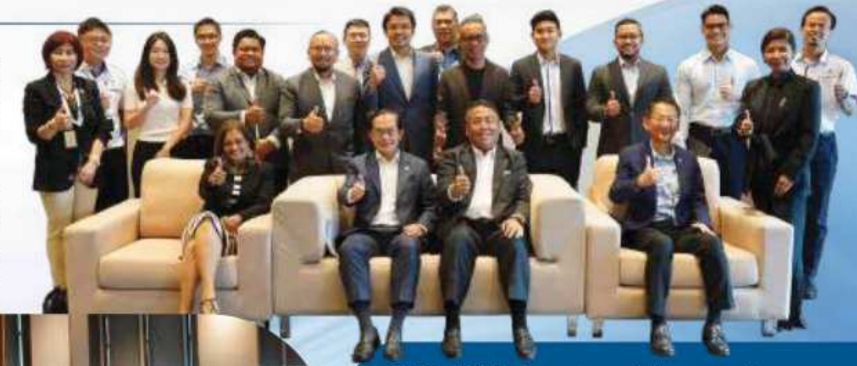
IOIC and IIC leaders coming together for a great session on corporate governance and sustainability.

Together, we are fortifying Malaysia's corporate governance, driving a more resilient and inclusive path forward.