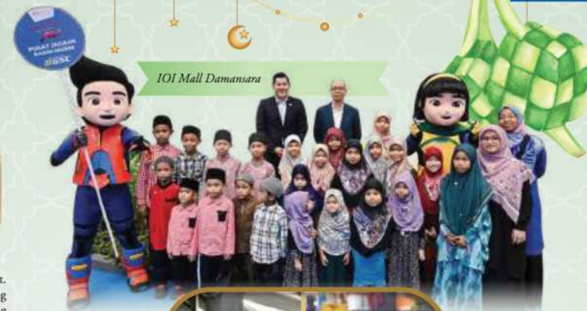
IOI Mall Damansara