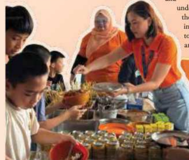
From fried rice to fried chicken to satay to oranges, the food was a delight!

All these wishes were part of the Wish Tree donation and sponsorship drive from 17 January to 5 February 2025 at IOI City Tower 2, a great opportunity for Team IOI and the public to support underprivileged children and make their wishes come true. This initiative reflects our commitment to education, youth development and making a lasting difference.