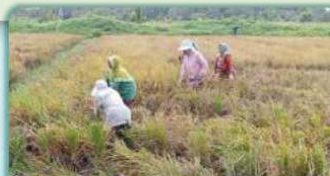
Harvesting a brighter future of food security and resilience.

This inaugural harvest programme builds on our Rice Farmer Empowerment Programme launched in October 2024. Senior Manager of PT SNA CSR & Partnership added: "PT SNA is committed to continuing this programme by expanding the planting area in order to stimulate the interest of the local community in developing agriculture, especially rice, to support food security. The rice variety used is Impari 30 , with the hope that a standard yield of four tons per hectare can be achieved." Ultimately, we aim to pave the way for a more food-secure future.