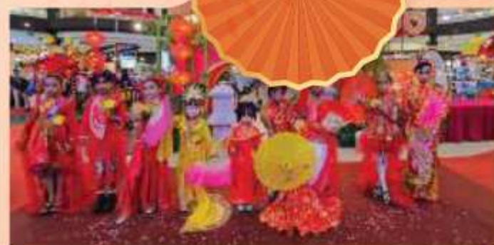
These little stars stole the show with their confidence and flair.