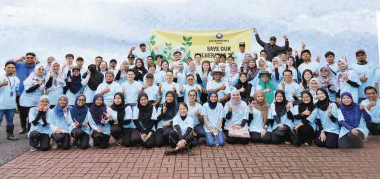
Team IOI, five MGBC staff members and 26 UTM students actively greening the Red List.

In former times, Dryobalanops aromatica , also known as Borneo Camphor, is easily recognisable. Not only is it famous for forming 'jigsaw puzzles' in the sky due to its massive height of up to 70 metres (m) and diameter of up to 2 m, but this evergreen tree produces a resinous smell. Even its fallen leaves, when crushed, emit this individualistic smell. Now, you can hardly smell or see this tree anywhere. The tree species has become so rare that it is listed as 'vulnerable' in the International Union for Conservation of Nature (IUCN) Red List of Threatened Species.