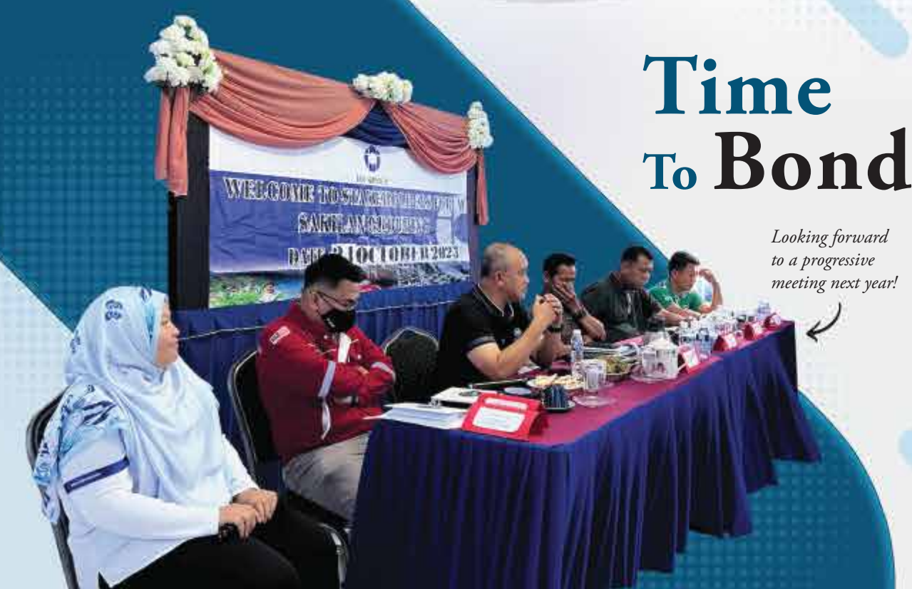
Looking forward to a progressive meeting next year!