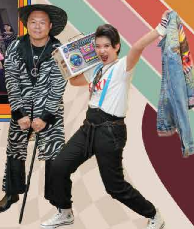
The retro-inspired Best Dressed male and female winners of the night.

Our Lucky Draw Grand Prize winner is off to the dreamy island of Phu Quoc, Vietnam. Congratulations to the rest of our 21 lucky draw winners who went back with their prizes such as a 43" television, air purifier, iPad and more.