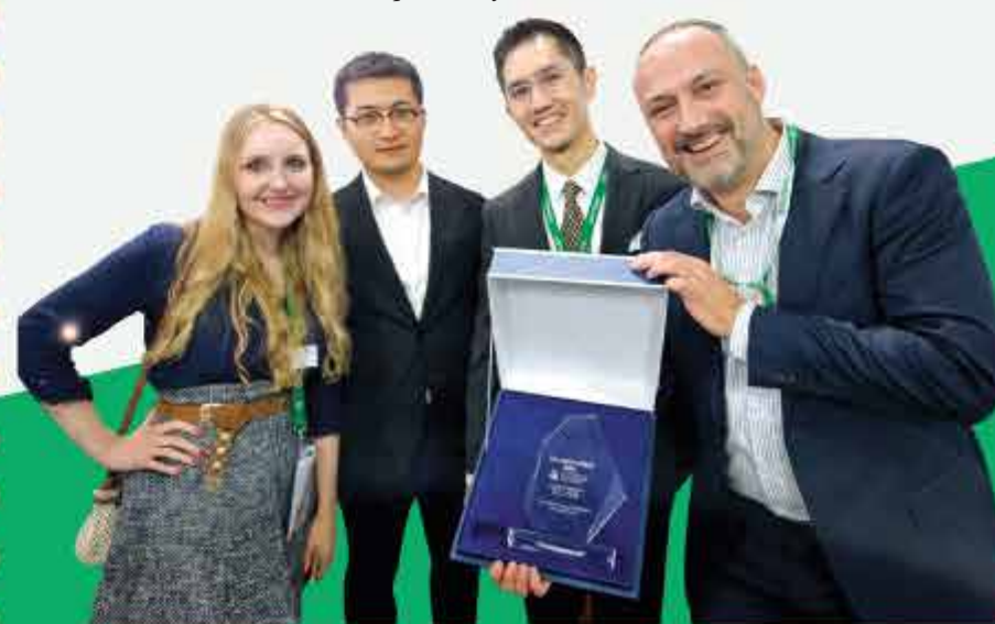
After we were nominated in the same category for the pre-selection at in-cosmetics Europe , our Personal Care team once again placed this ingredient in the spotlight through diverse activities such as Formulation Lab, Innovation Box and more at our trade exhibitions. And it was worth it!

Our innovative and functional SOFTISAN® MagicPOWDER S impressed the judges at the in-cosmetics Asia Awards on 8 November 2023 in Bangkok, Thailand, and we bagged the silver Innovation Zone Best Active Ingredient Award . Check out this wonder at: https://cutt.ly/BwGULJze