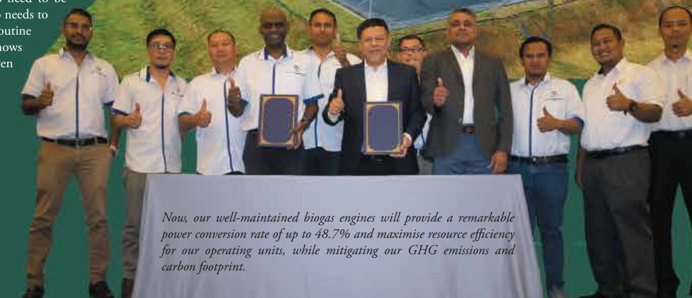
Now, our well-maintained biogas engines will provide a remarkable power conversion rate of up to 48.7% and maximise resource efficiency for our operating units, while mitigating our GHG emissions and carbon footprint.

We recently partnered with UMW Group's wholly-owned subsidiary, UMW Industrial Power Services Sdn Bhd (UIPS), to ensure the optimal performance and longevity of our biogas engines so that we can achieve our net-zero GHG emissions for Scope 1, 2 and 3 by 2040. We signed a 16-year long-term service agreement with UIPS on 6 December 2023 which covers maintenance services and engine block replacement for all our seven Jenbacher biogas engines, commanding a total generation capacity of 5,523 kW to power our palm oil mill operations, living quarters and auxiliary usage.