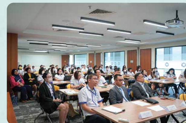
Around 400 employees across Malaysia, including our Board of Directors and senior management team, participated either remotely or physically in the forum.