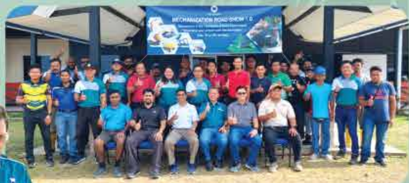
Let us integrate mechanisation in our operations.

Thanks to our mechanisation efforts, IOI Plantation Services Sdn Bhd has increased the harvesters' productivity by 25% to 33%. Did you know that we have also reduced our dependency on our workers, and improved our land-to-harvester ratio from 1:16 to 1:23 hectares? So far, we have implemented block harvesting at about 96% of suitable estates with 80% of potential hectareage being converted to a mechanised mainline fresh fruit bunches evacuation system.