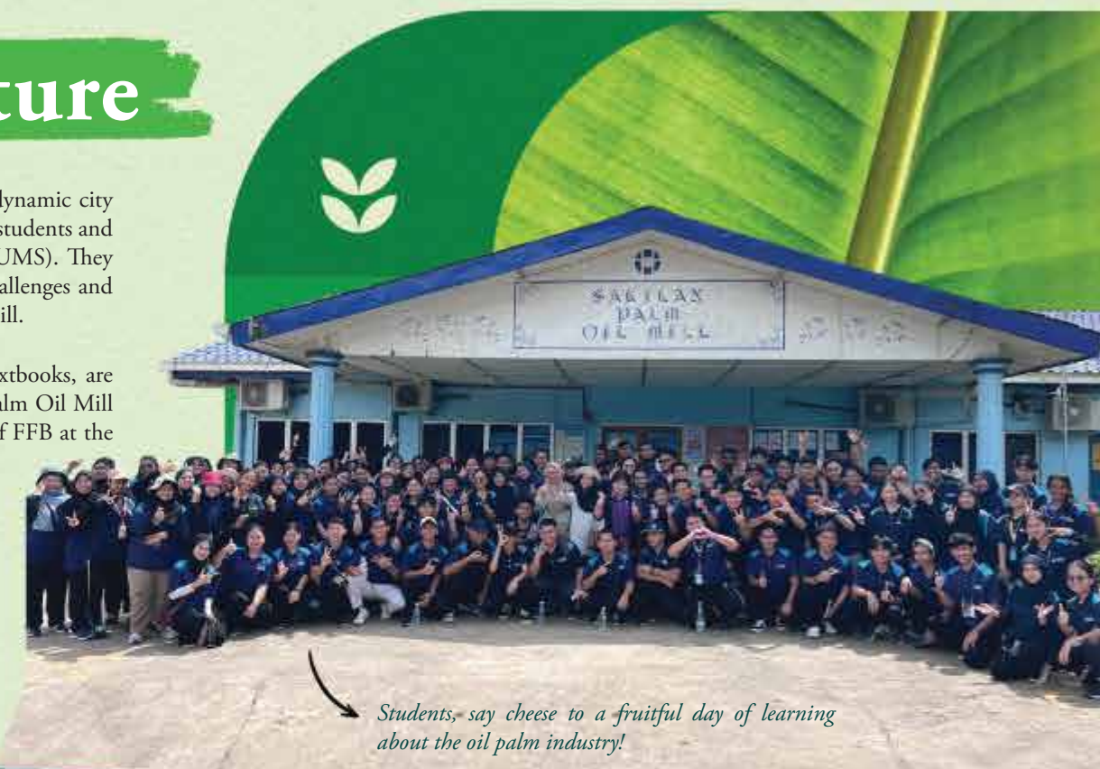
Students say cheese to a fruitful day of learning about the oil palm industry!

The sunny morning of 27 November 2023 was a fruitful session. Who knows? One of them may become our future colleagues.