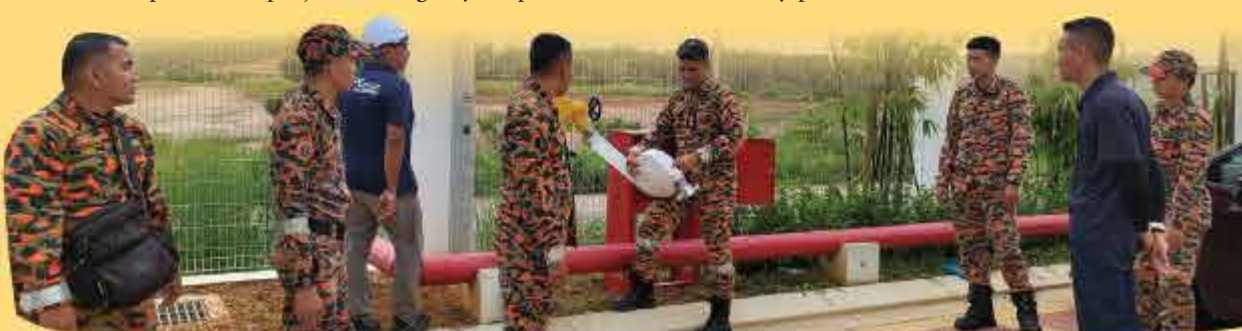
Yes, our fire hose reel system is located in a prominent place and has the right working pressure for water to flow freely.

Our next step is to set up a joint Emergency Response Team to address any potential future risks.