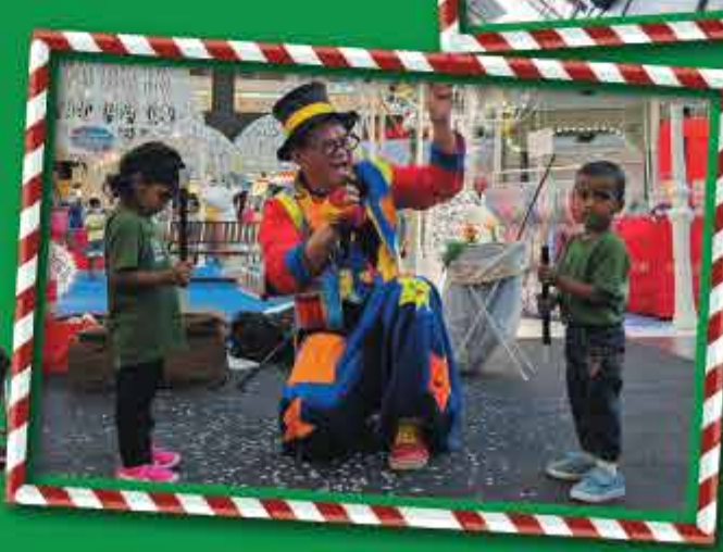
Look, I am reaching the top!