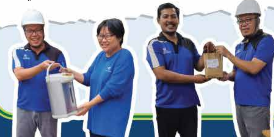
Say goodbye to the old tech, and welcome the new year with a small token for responsibly handling e-waste.

IOI Pan-Century gave a new lease of life to a massive one-tonne of e-waste at our inaugural E-Waste Recycling Drop Off programme. We collaborated with Cenviro Recycling & Recovery Sdn Bhd to set up designated collection points from 4 to 12 December 2023 for employees to responsibly discard their used gadgets – knowing that their e-waste will be turned into environmental solutions or e-solutions to protect the environment. Cenviro, a leading licensed recycling facility in Malaysia, will dismantle the e-waste into reusable parts or discard them sustainably to prevent environmental pollution thus minimising our impact on future generations.