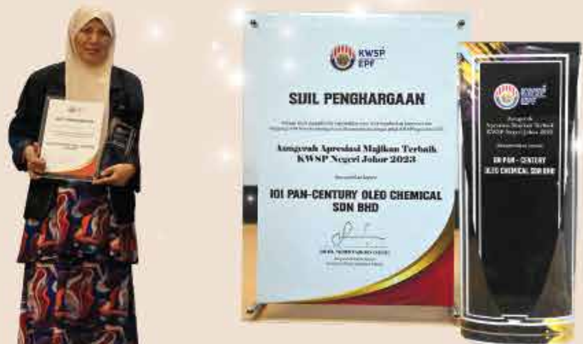
Our Human Resources Department received the award from EPF at Opero Hotel in Johor on 30 November 2023.

When it comes to employee welfare, we do our best to give our employees good financial well-being, competitive wage packages, incentives and benefits. Recently, the Employees Provident Fund (EPF) of Johor recognised the commitment of IOI Pan-Century Oleochemicals Sdn Bhd. We received the Best Employer Award 2023 for our compliance with statutory bodies and our exemplary efforts such as the Voluntary Excess contribution, which is a popular scheme among our employees. We will continue to advance our employees' well-being because employees are our greatest asset.