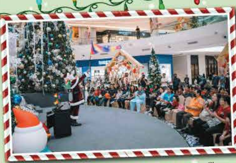
The audience enjoying magic tricks from Santa Claus.

The children having the time of their lives in IOI City Farm which features 17 different species of animals, a collection of 111 species of living plants and 50 freshwater aquatic species.