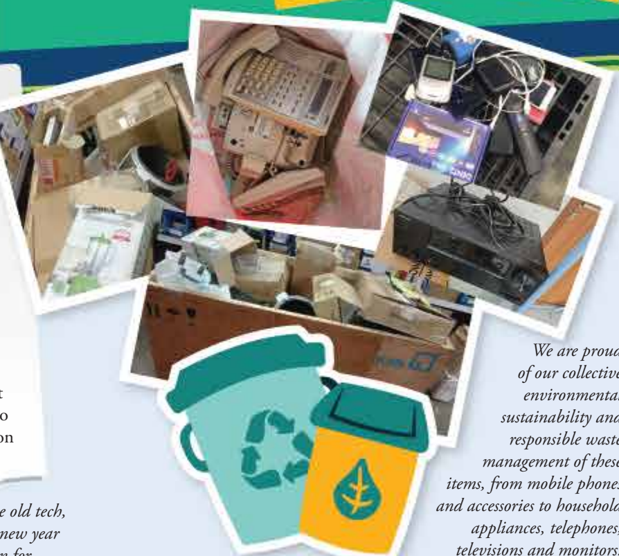
We are proud of our collective environmental sustainability and responsible waste management of these items, from mobile phones and accessories to household appliances, telephones, televisions and monitors.