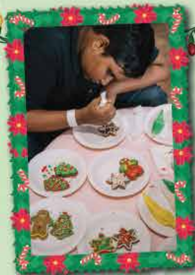
Decorating gingerbread men was one of the highlights of the day for the children.

Malaysian Association of Paediatric Palliative Care is just one of the 18 beneficiaries, which include Society for the Severely Mentally Handicapped, The Edge Education Foundation, The Lost Food Project, Universiti Tunku Abdul Rahman and more.