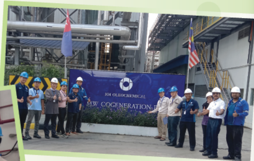
From 8 to 11 December 2023, the Energy Conservation Center from Japan plus the Sustainable Energy Development Authority and Energy Commission performed a joint energy audit at our oleochemical plant. The audit provided a detailed diagnosis of our energy management system, which is insightful to improve our energy efficiency.