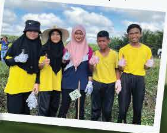
Even our youth from HUMANA schools were here to make a positive contribution to our planet.