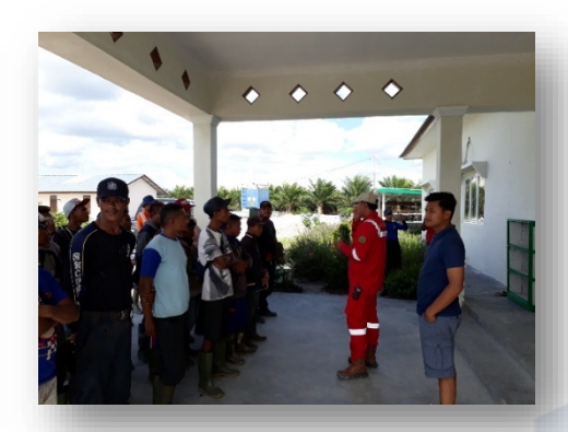
Staff and workers undergoing training from the local fire department

IOI is also working in partnership with the Natural Resource Conservation Agency (Balai Konservasi Sumber Daya Alam - BKSDA), to identify rare, threatened and endangered (RTE) species, including Orangutan surrounding the areas of Gelinggang Lake. The Group also conducted a joint-patrol programme with the police and armed forces in the areas around the lake that are potentially prone to encroachment and illegal hunting.