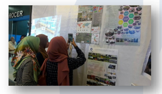
IOI staff members manning the booth (left) and Public display of IOI's sustainability practices (right)